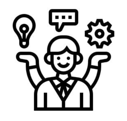
18 May 2023 Church and Ministry Administrators